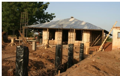
Below: Pillars going up.