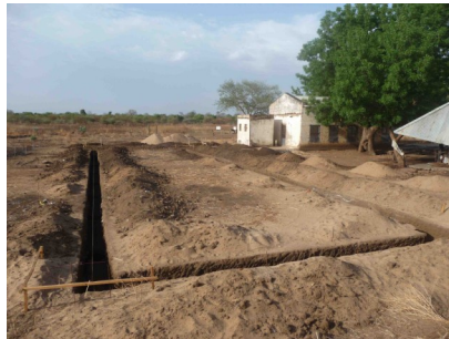
Above: First, the foundation is laid.

1937 The year that SIM first began work among the Mabaan people.